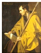
St Thomas the Apostle. Diego Velázquez 1619

Thomas, one of Jesus' 12 apostles, was an impulsive, confused, honest sceptic. Jesus could understand and work with such a man. Thomas' impulsiveness was evident when Jesus prepared to visit Lazarus in Bethany. It was a dangerous trip to make, because of the Jews, but Thomas urged his fellow disciples: "Let us also go, that we may die with Him." (John 11:16) Instead, Jesus brought Lazarus back to life.